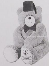
Love to the rescue® Ambassador: Fezzly

Shriners Help Kids Get Back on Their Feet