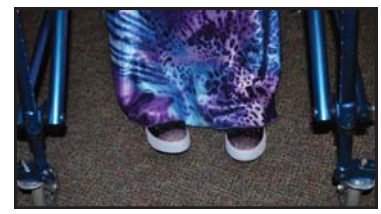
These feet were made for dancing & that's just what they did!