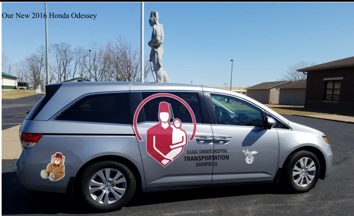
Our New 2016 Honda Odessey

Zimmerman Honda -7030 - 44 th Avenue Moline, IL 61265 -- 309-76 Honda